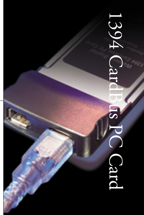
1394 CardBus PC Card

NOTE: Look for Western Digital's 1394 hard drives and other products at your favorite computer store or Western Digital's online store at www.westerndigital.com/store .